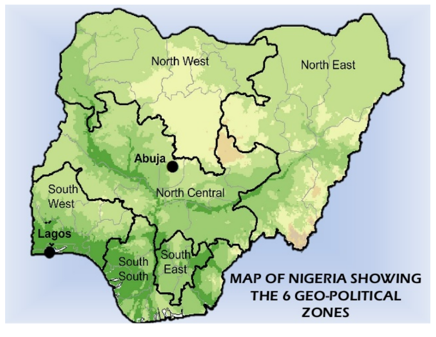
Map of Nigeria Showing the Six (6) Geo-political Zones